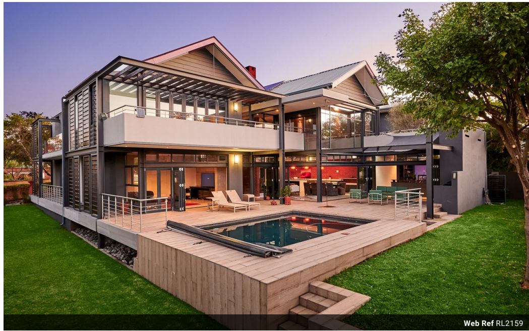
Web Ref RL2159

91 Carlswald Estate Walton Road Carlswald Midrand 1684