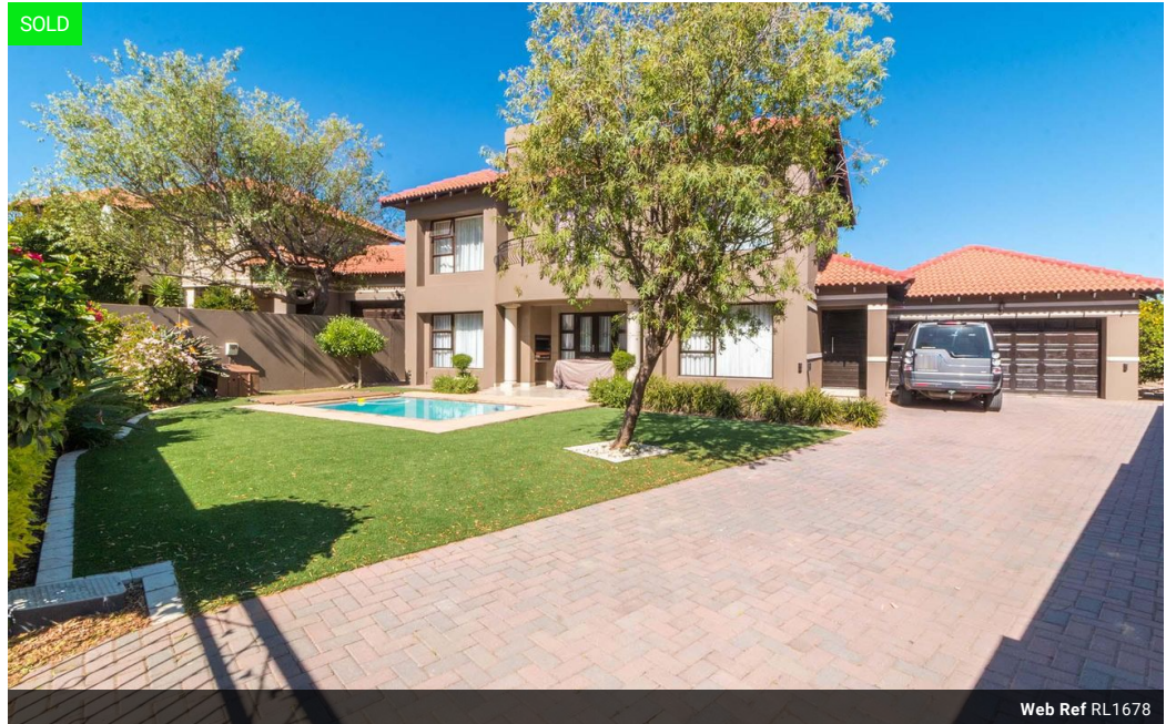
Web Ref RL1678

91 Carlswald Estate Walton Road Carlswald Midrand 1684