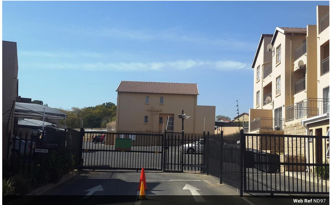
Web Ref ND97

91 Carlswald Estate Walton Road Carlswald Midrand 1684