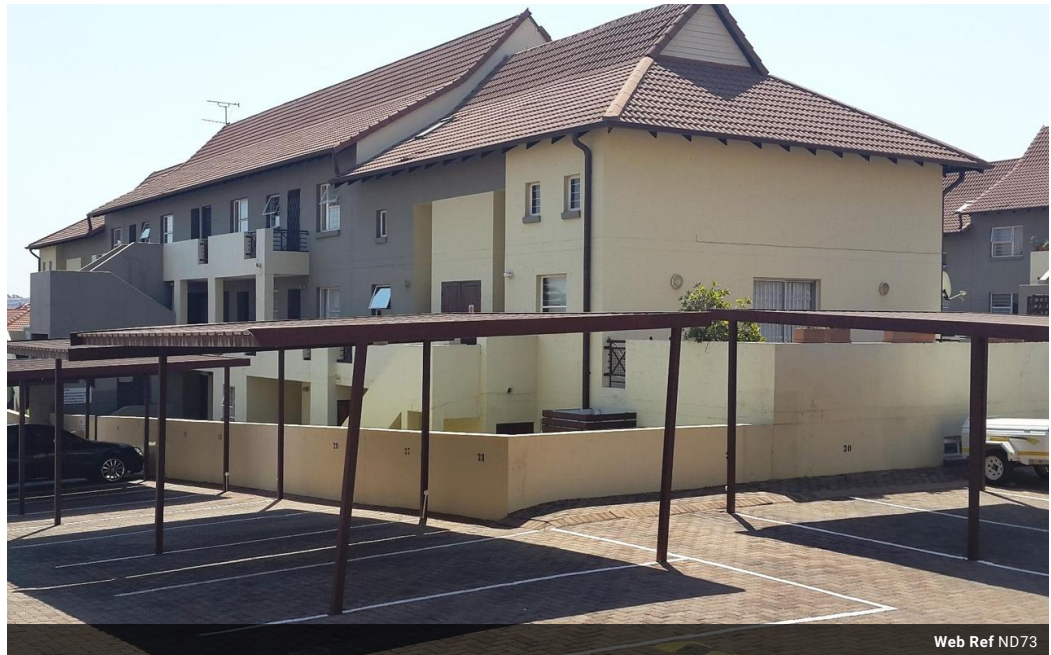
Web Ref ND73

91 Carlswald Estate Walton Road Carlswald Midrand 1684