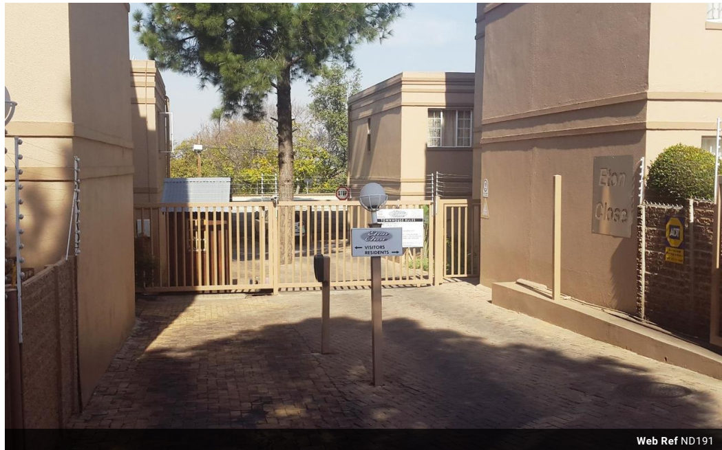
Web Ref ND191

91 Carlswald Estate Walton Road Carlswald Midrand 1684