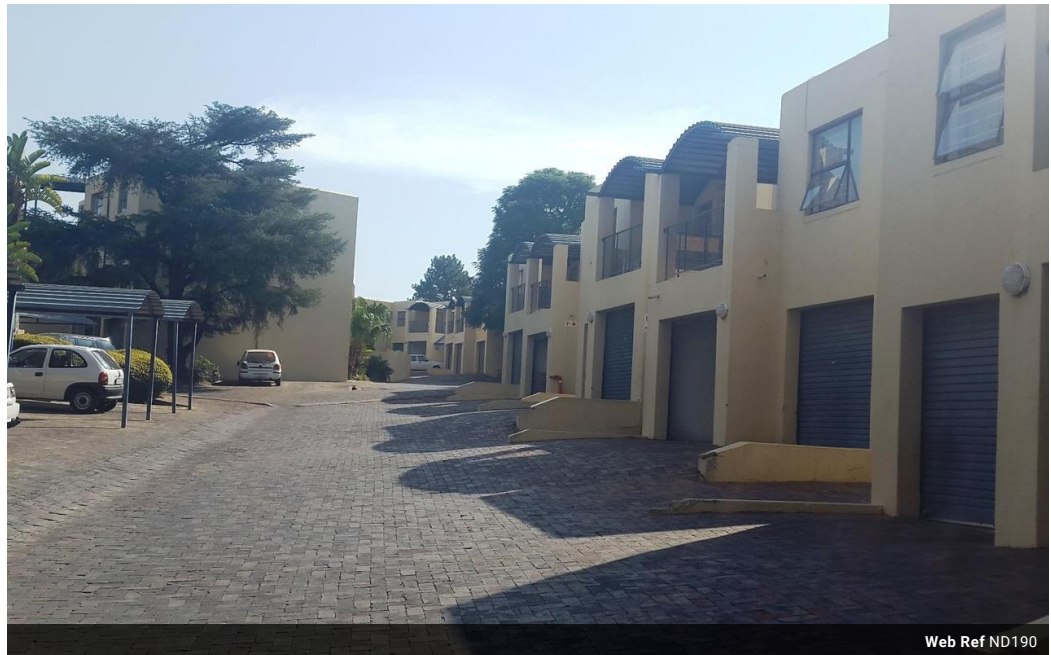
Web Ref ND190

91 Carlswald Estate Walton Road Carlswald Midrand 1684