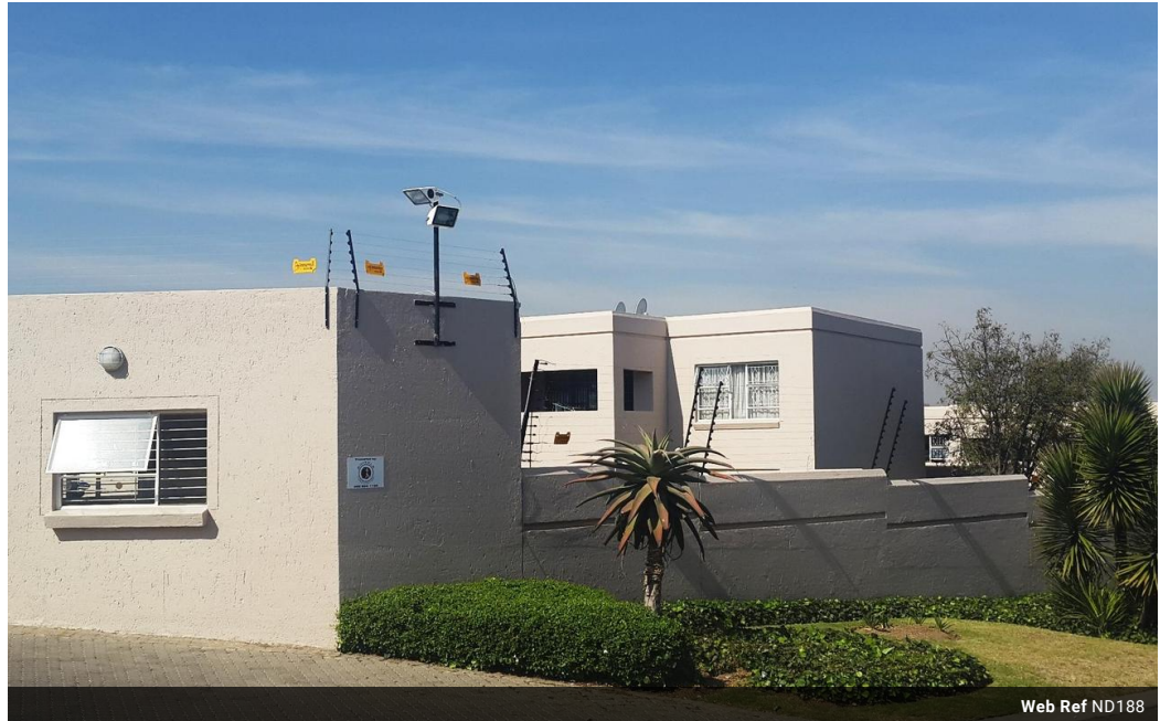
Web Ref ND188

91 Carlswald Estate Walton Road Carlswald Midrand 1684