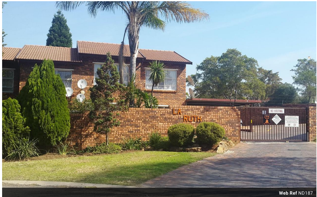
Web Ref ND187

91 Carlswald Estate Walton Road Carlswald Midrand 1684