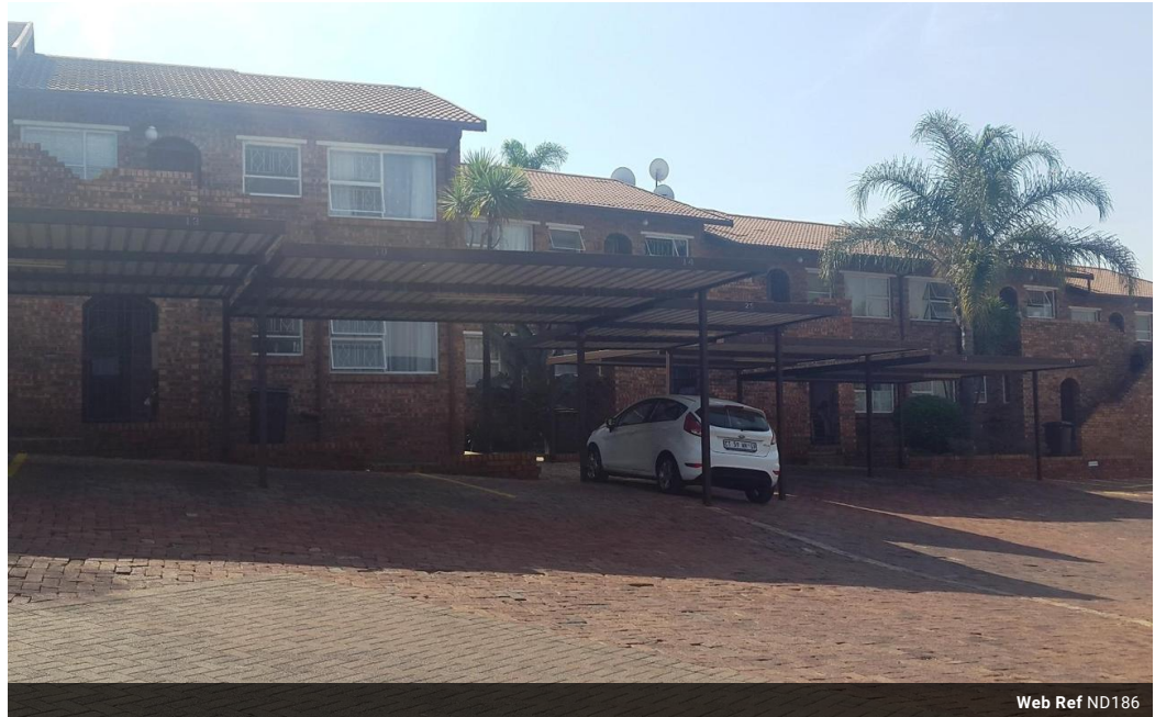
Web Ref ND186

91 Carlswald Estate Walton Road Carlswald Midrand 1684