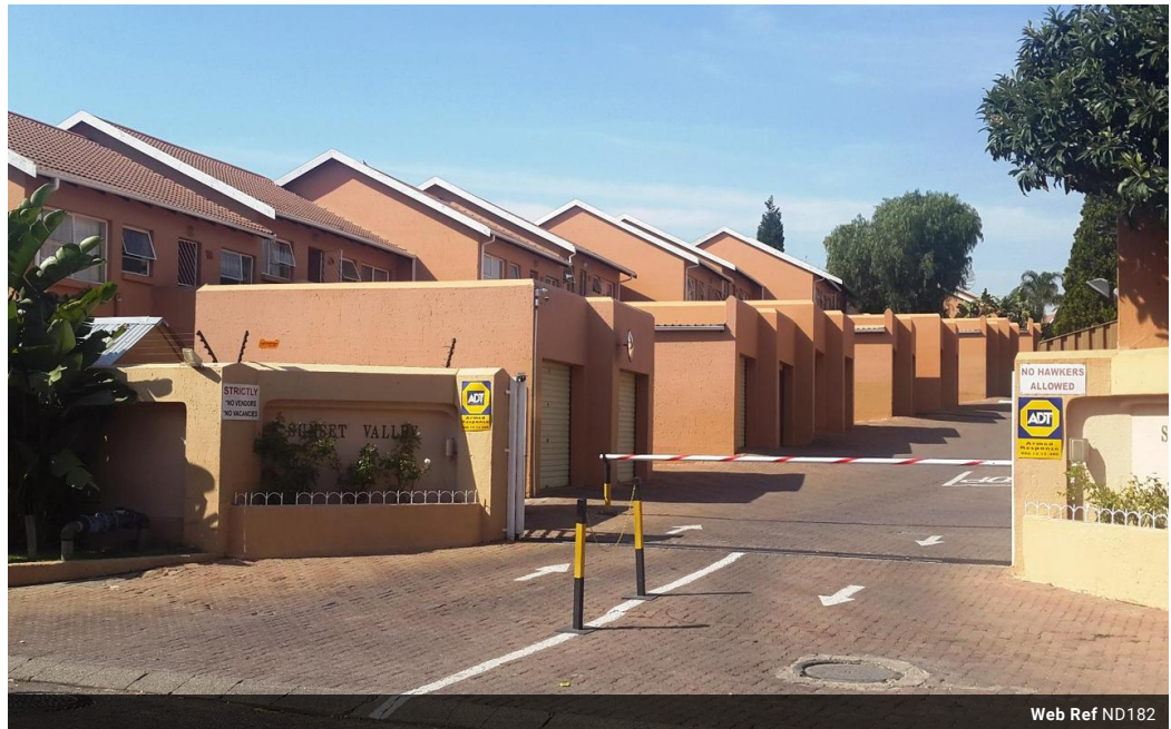
Web Ref ND182

91 Carlswald Estate Walton Road Carlswald Midrand 1684