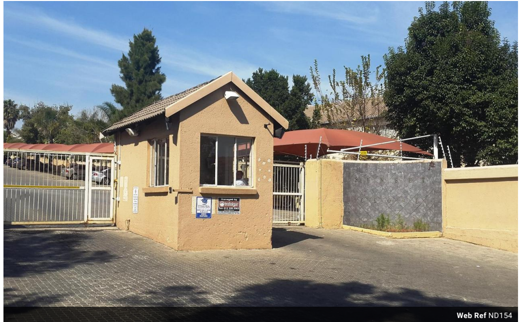
Web Ref ND154

91 Carlswald Estate Walton Road Carlswald Midrand 1684