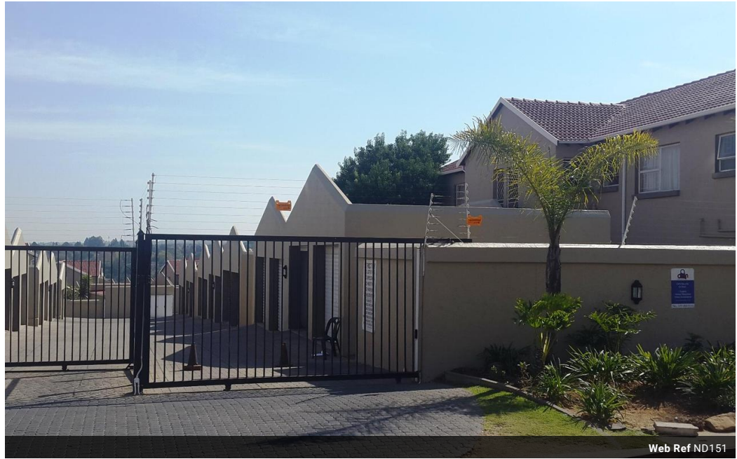
Web Ref ND151

91 Carlswald Estate Walton Road Carlswald Midrand 1684