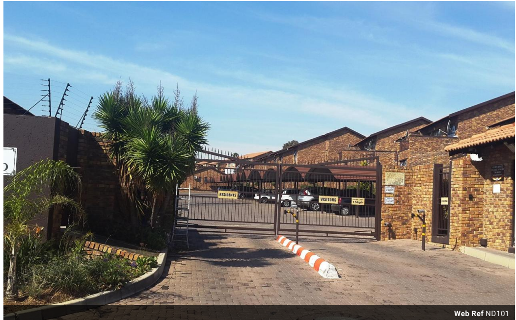
Web Ref ND101

91 Carlswald Estate Walton Road Carlswald Midrand 1684