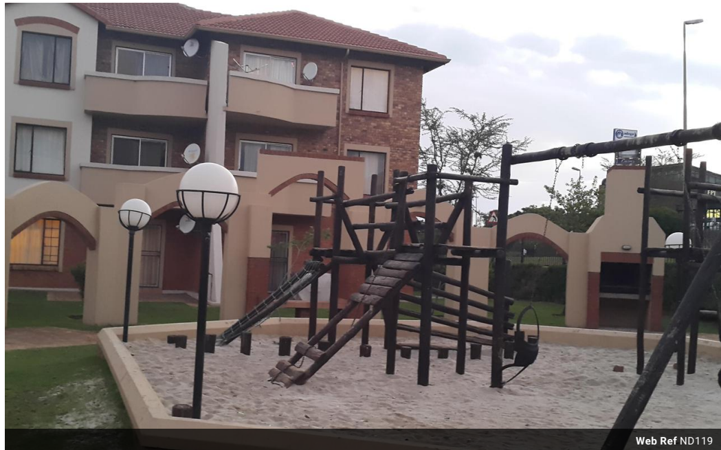
Web Ref ND119

91 Carlswald Estate Walton Road Carlswald Midrand 1684